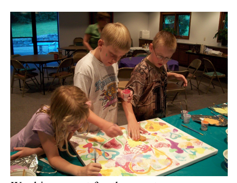
Working on art for the sanctuary.

Overall, Vacation Bible School ("Beatitudes Attitudes") was a great success. In addition to making pillows as a local mission project, we also adopted the "What If? Foundation" as a mission project to help feed hungry kids in Haiti. Thanks to the support of the congregation, we raised over $150.00! That's about 250 meals! We truly made the Beatitudes come alive during this wonderful week.