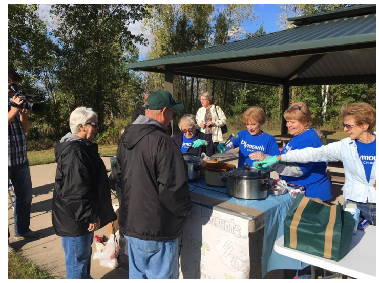
We raised $350 for playground equipment for County Farm Park at our Westridge Neighborhood Association picnic.