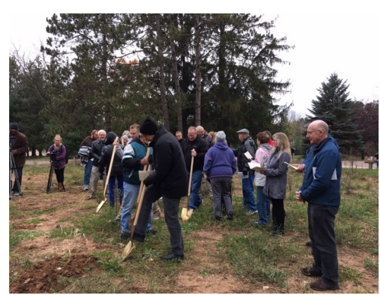
October 29 Breaking ground!