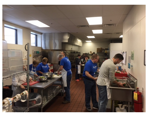
Serving at the Community Table