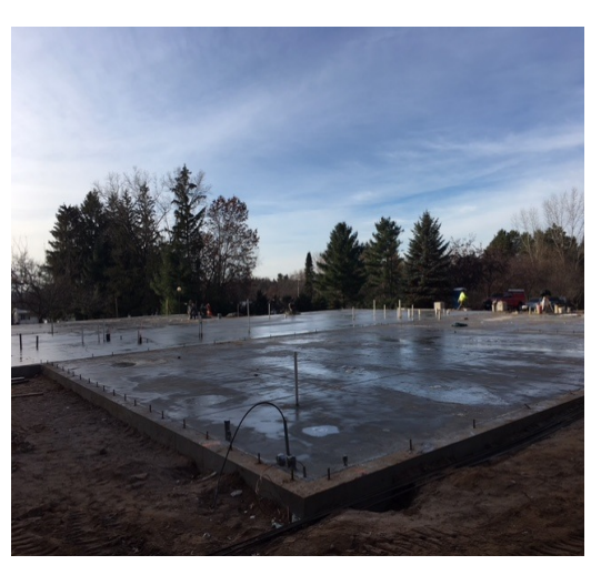
The entire slab is now finished! (Soon we'll see walls!)