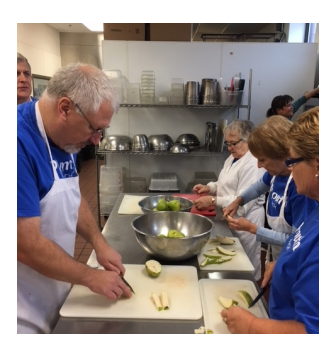
Plymouth chefs at work.