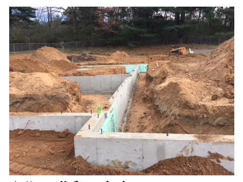
A "sure" foundation.