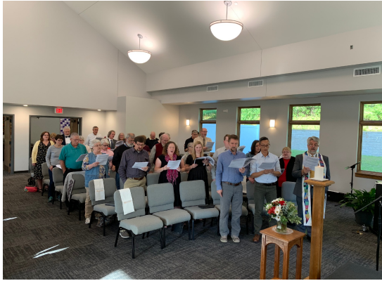
Service of Dedication