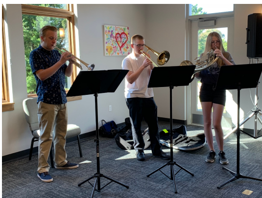
Plymouth Brass Trio