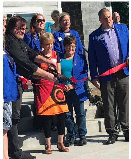
Ribbon cutting on September 13