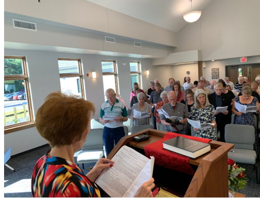
Service of Dedication