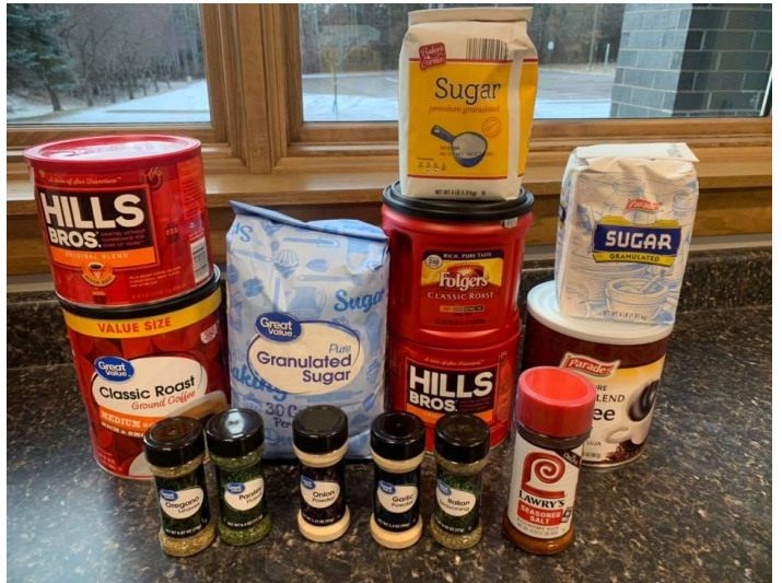
Our gifts of coffee, sugar and spices for the Community Table.