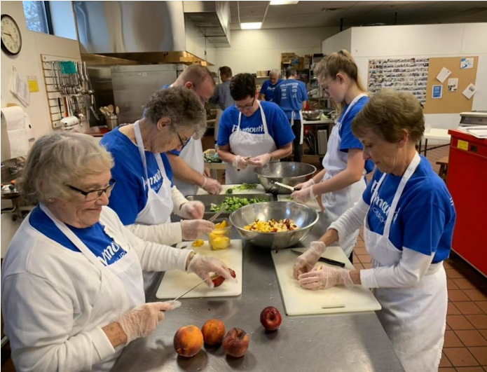
Plymouth members preparing a meal for the Community Table.