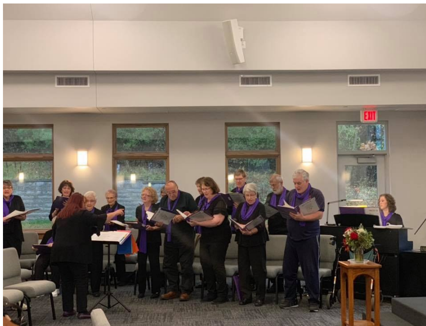
Stand in the Light Memory Choir shared their music with us in worship.