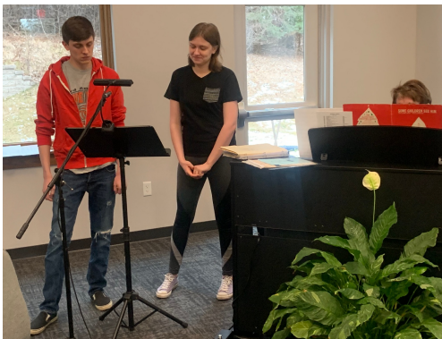
Practice for Christmas Eve