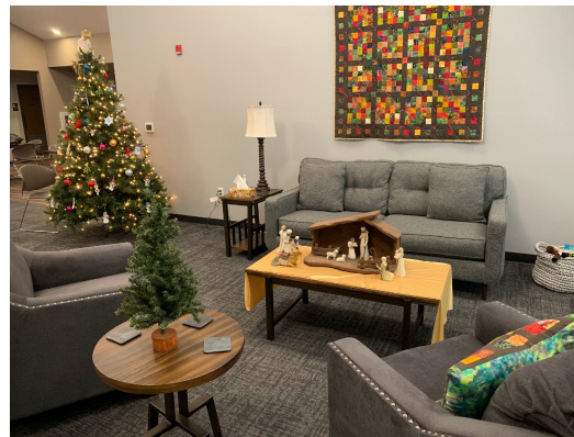
Gathering space all decked out.