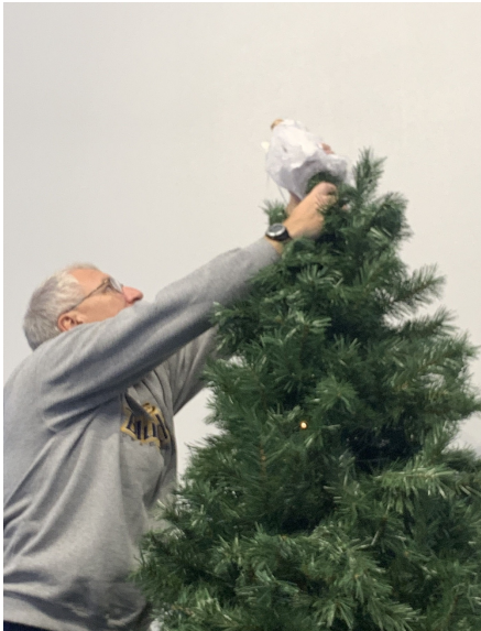
Decorating the tree in the sanctuary.