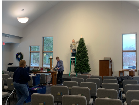
Getting ready for Christmas.