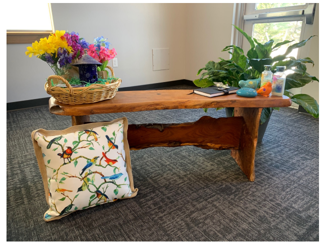
In the garden...