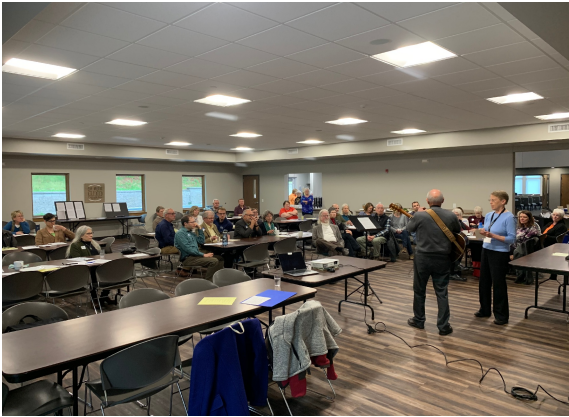
The Eau Claire faith community and others gathered at Plymouth for the Sustainable Community: Renewable Energy and Faith event.