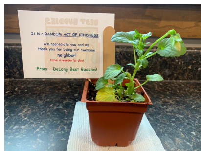
A random act of kindness from the students at DeLong!