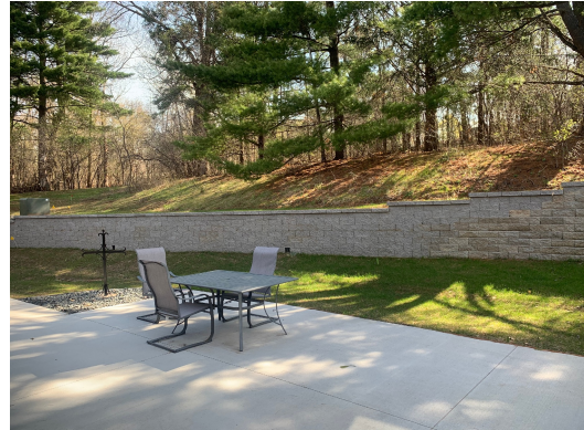
On a sunny day, our patio is a shaded quiet spot to sit and read. Or to sit and listen for God.