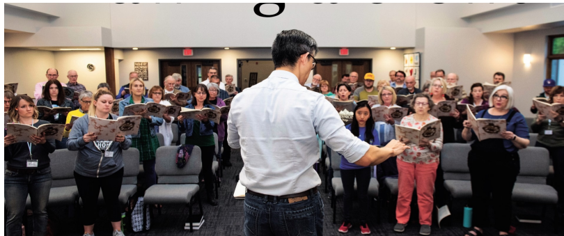
Plymouth hosted the newly created Chippewa Valley Festival Choir for two month's worth of rehearsals for their May 18 concert of Carmina Burana with the Chippewa Valley Symphony Orchestra at the Pablo Center. Thank you, Plymouth, for opening your doors! The members of the choir and the board members of the symphony really appreciated being able to use our space!