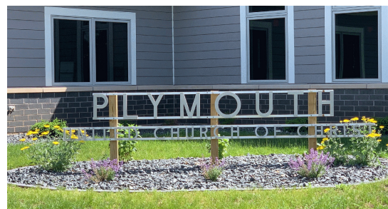
Now it feels more like "home."