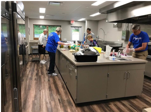
Getting ready for the Pie & Ice Cream Social.