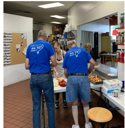
More Community Table volunteers