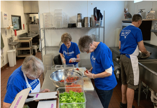
Preparing a meal for the Community Table