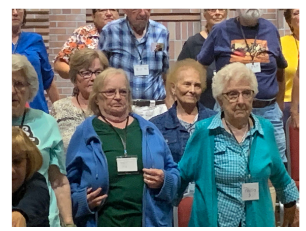
Stand in the Light Memory Choir