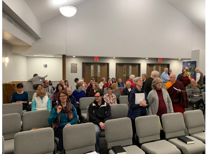
We hosted the Interfaith Prayer Service.

----- Order Easter flowers to decorate the chapel and then take them home and plant them in your own yard after Easter. The flowers may be placed in memory or in honor of a loved one. Our order must be placed by March 27 to guarantee availability. Please fill out the information below and return it with your payment to the church office by then if you can. Checks should be made out to Plymouth United Church of Christ.