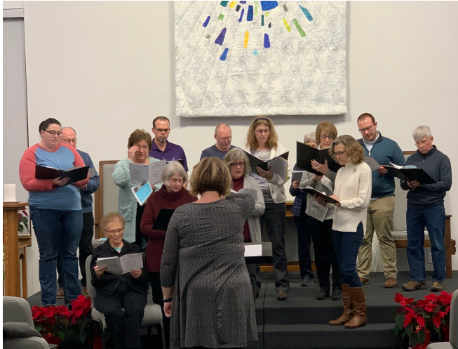
Volunteers from Plymouth, Lutheran Church of the Good Shepherd, and St. James formed a choir for the Interfaith Prayer Service.